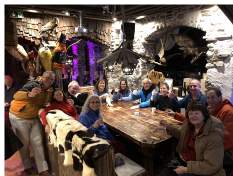
Fagowee Austria Trip 2024