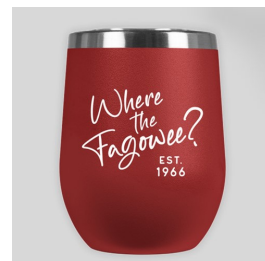
12 oz. Stainless Steel Insulated Tumbler

This beauty needs to be part of your Fagowee travel set. Stainless Steel Insulation will keep your Wine COLD or your Hot Toddys HOT. Bring it to the beach, to Canaan, and everywhere else!