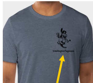
Fagowee Logo in Black on the FRONT