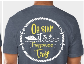
With Cool Cruising Graphic on the BACK